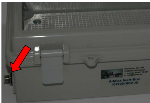
IB-K192910SV Gas inlet