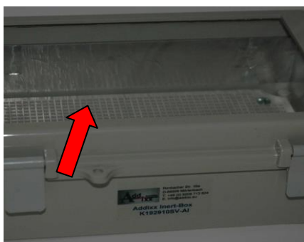
IB-K192910SV Window for irradiating