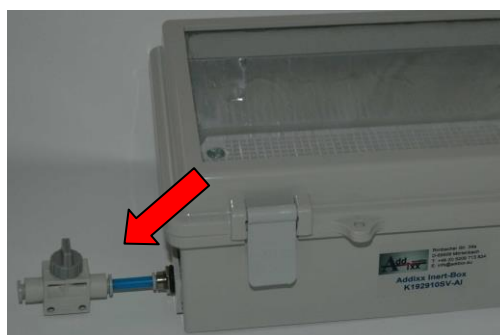
IB-K192910SV Gas inlet valve