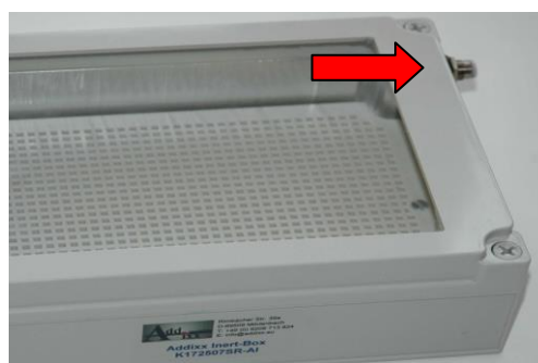
IB-K172507SR Gas outlet