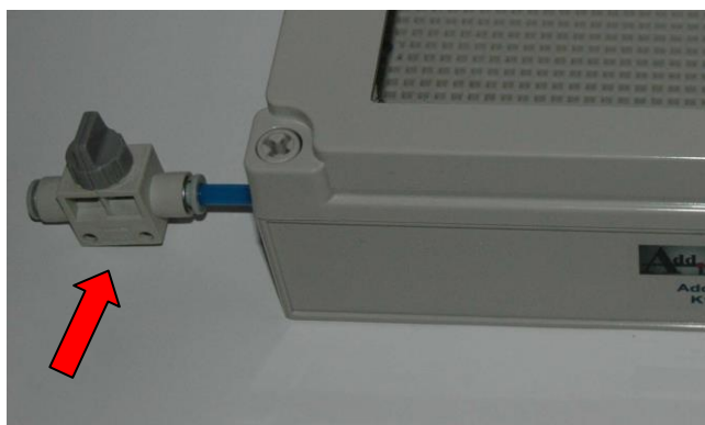
IB-K172507SR Gas inlet valve