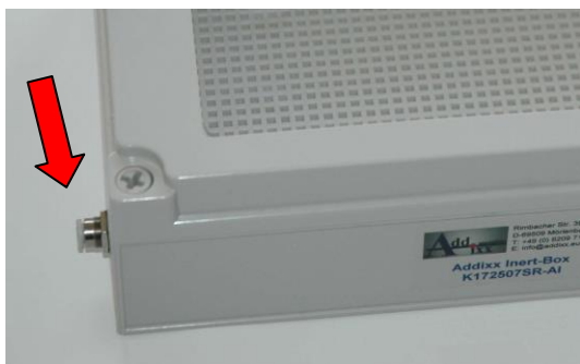
IB-K172507SR Gas inlet