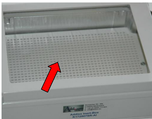
IB-K172507SR Window for irradiating