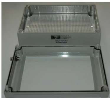
IB-K172507SR Open Inert Box