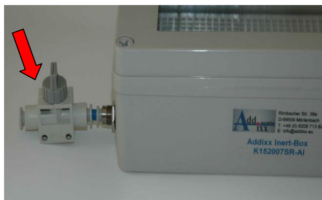
IB-K152007SR Gas inlet valve