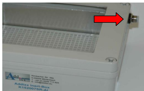
IB-K152007SR Gas outlet