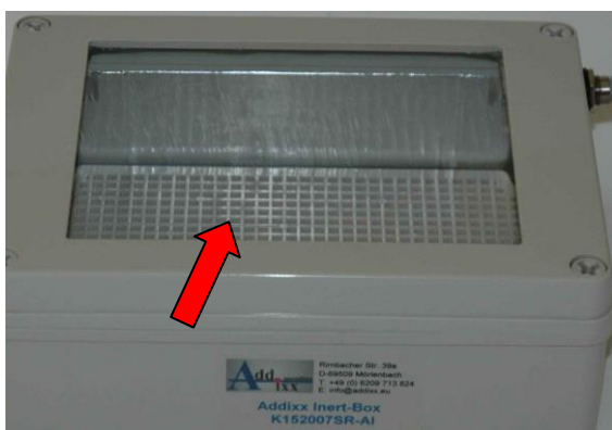
IB-K152007SR Window for irradiating