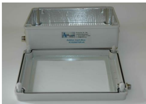
IB-K152007SR Open Inert Box