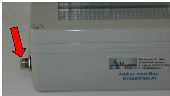
IB-K152007SR Gas inlet