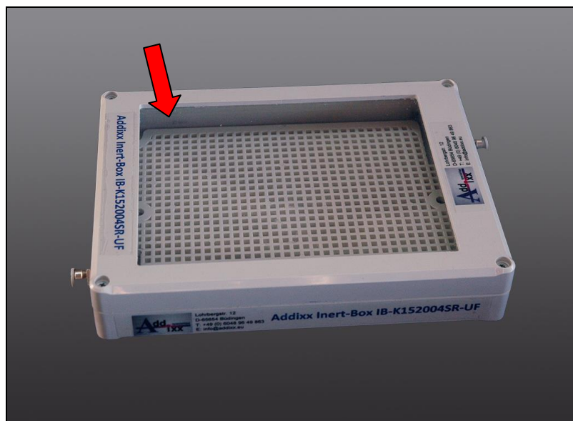
IB-K152004SR-UF Window for irradiating