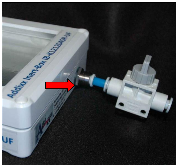
IB-K121204SR-UF Gas inlet / Gas outlet with valve