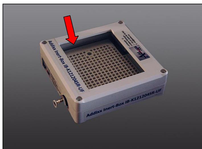
IB-K121204SR-UF Window for irradiating