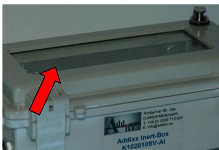
IB-K102010SV Window for irradiating