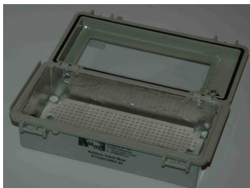
IB-K102010SV Open Inert Box