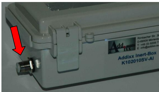
IB-K102010SV Gas inlet