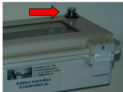
IB-K102010SV Gas outlet