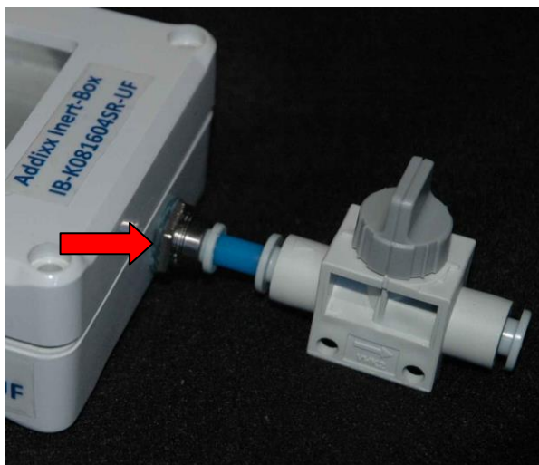
IB-K081604SR-UF Gas inlet / Gas outlet with valve