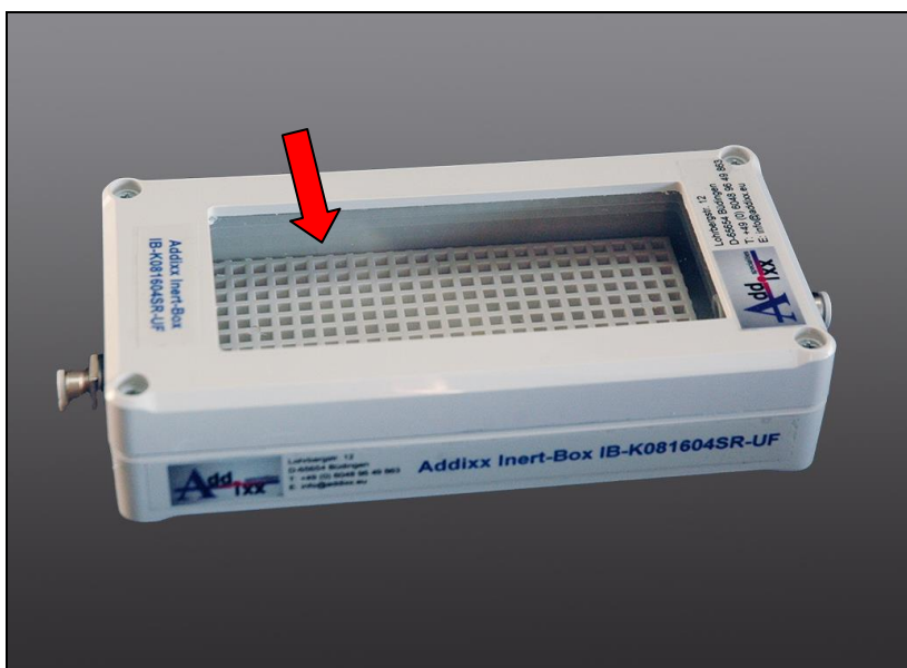
IB-K081604SR-UF Window for irradiating