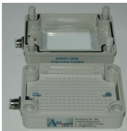
IB-K081104SR Open Inert Box