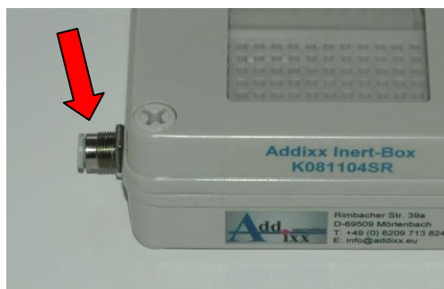
IB-K081104SR Gas inlet