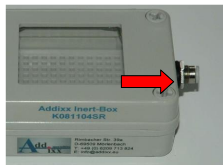
IB-K081104SR Gas outlet