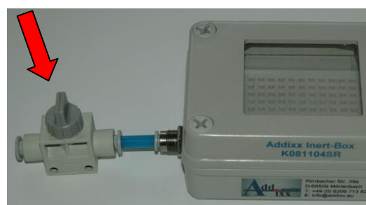
IB-K081104SR-1V Gas inlet valve