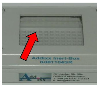
B-K081104SR Window for irradiating